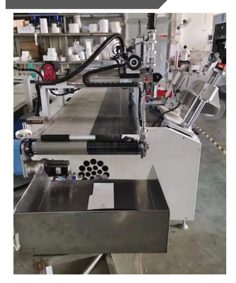
Automatic tape machine