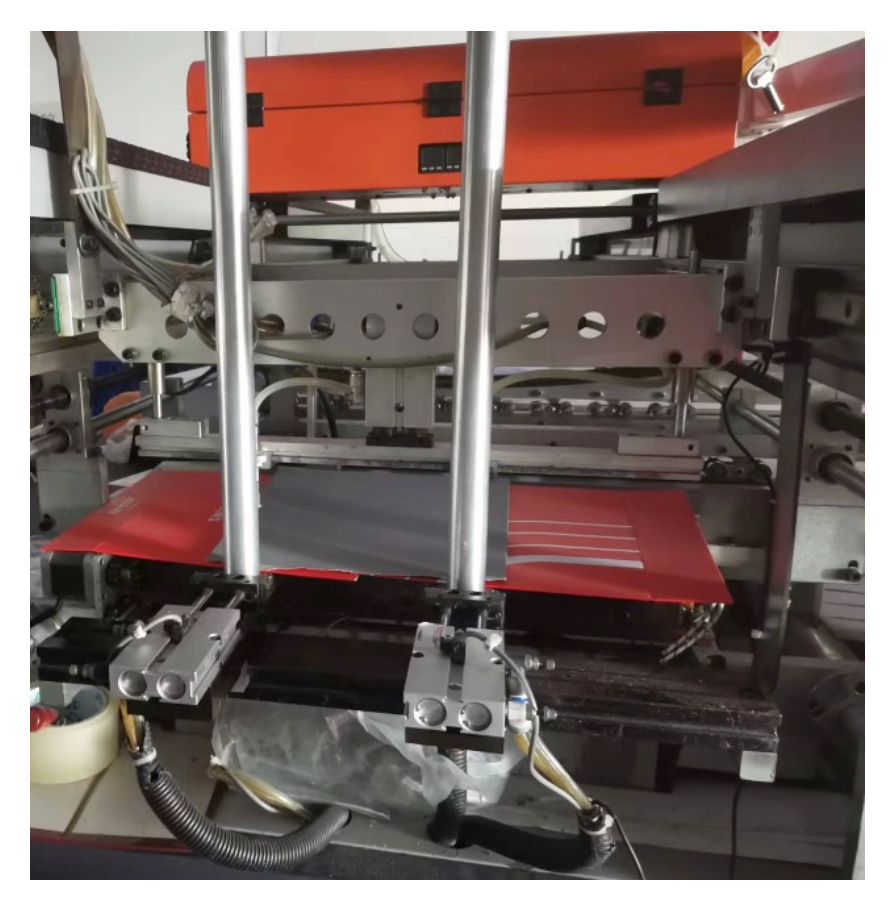
Automatic magnet machine