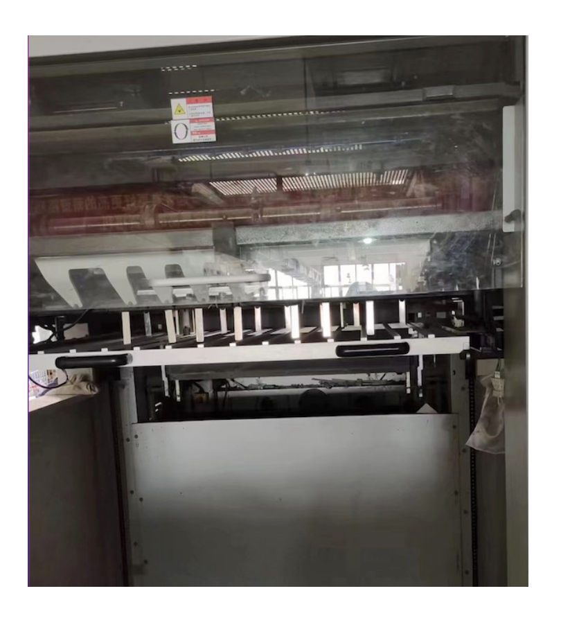
Cutting paper machine