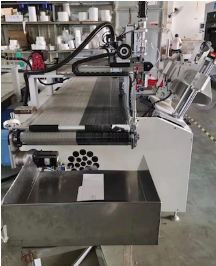
Automatic tape machine