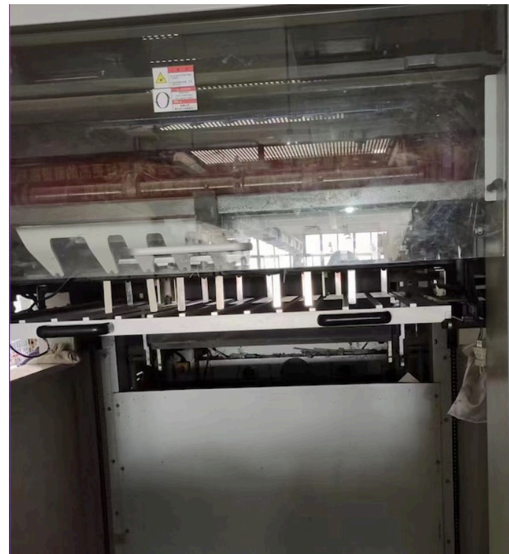
Cutting paper machine