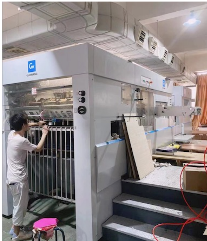
Automatic die cut Machine