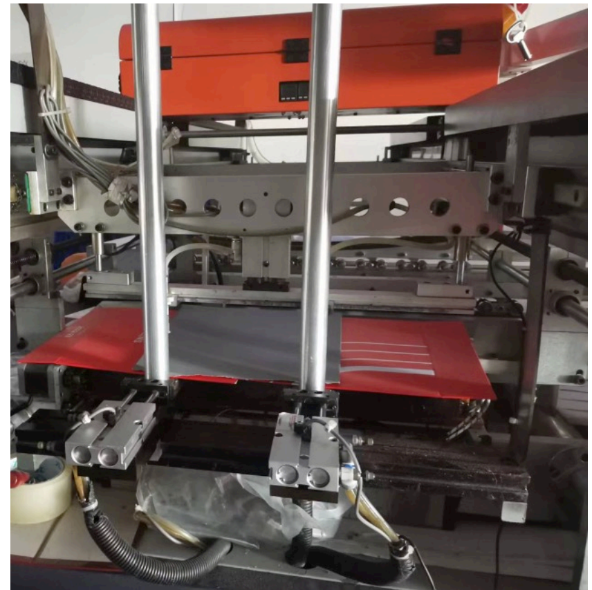
Automatic magnet machine